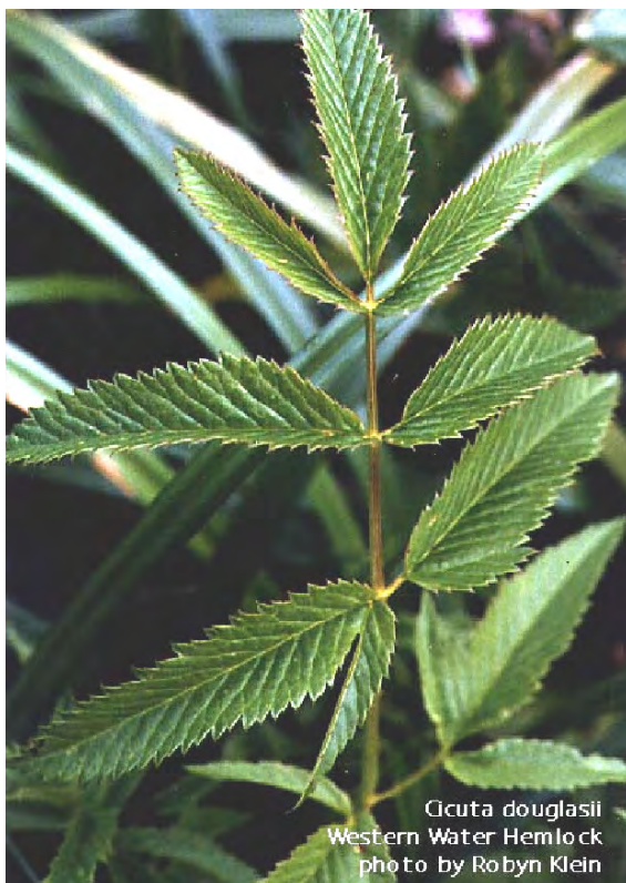
Cicuta douglasii Western Water Hemlock

There are currently no biological control methods available for water hemlock.