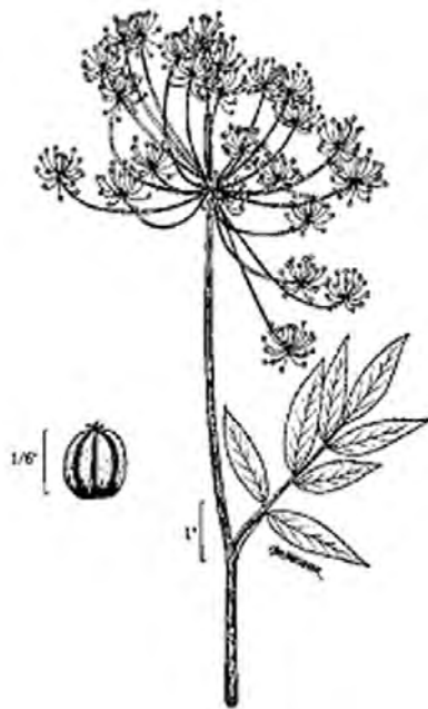
USDA-NRCS PLANTS Database / USDA NRCS. Wetland flora: Field office illustrated guide to plant species.